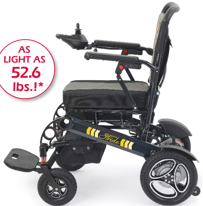
Portable & high-performing with an aluminum frame!