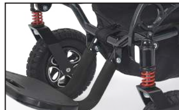
Comfort Spring Suspension for a Smooth Ride