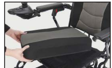
Removable Padded Seat