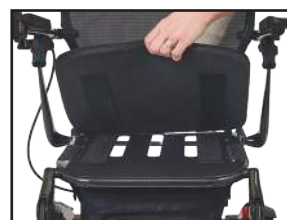
Removable 1.25" Thick Padded Seat