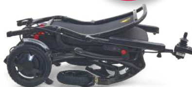
East One-Step Folding for Transport