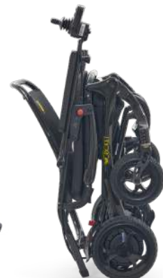
Stands on End for Storage