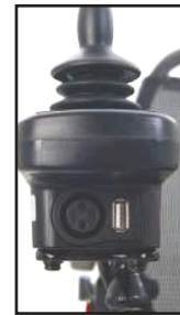
Convenient USB Charging Port